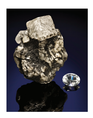
PHENACITES, ABOVE: Nigerian, Russian LEFT, TOP: Russian with Green Alexandrite, BOTTOM: Rare orange, OPPOSITE: Azozeo Phenacite Crystals